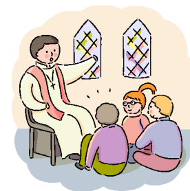
Wednesday Weekday School

The children have begun practicing on Wednesday nights and a final practice will be held Saturday, December 15 th from 10:00 – 11:00 am.